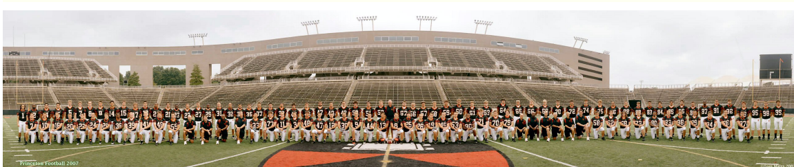
PRINCETON FOOTBALL TEAM 2007