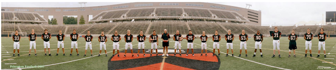
PRINCETON FOOTBALL SENIORS 2007

NOVEMBER 10 TH , I WILL BE DOING A PANORAMIC GAME SHOT THIS CAN BE ADDED TO THE TEAM, TEAM AND SENIOR, FRAMED PRODUCT FOR A TOTAL PRICE OF $389.00 FOR THREE PRINTS