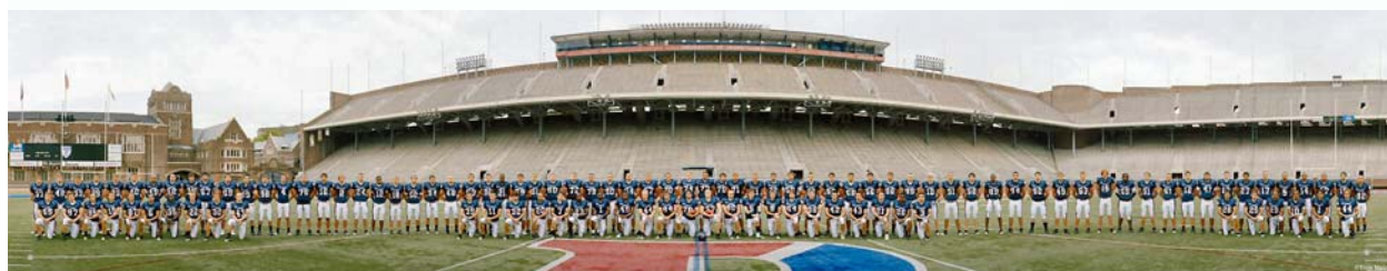
University of Pennsylvania 2008 Football