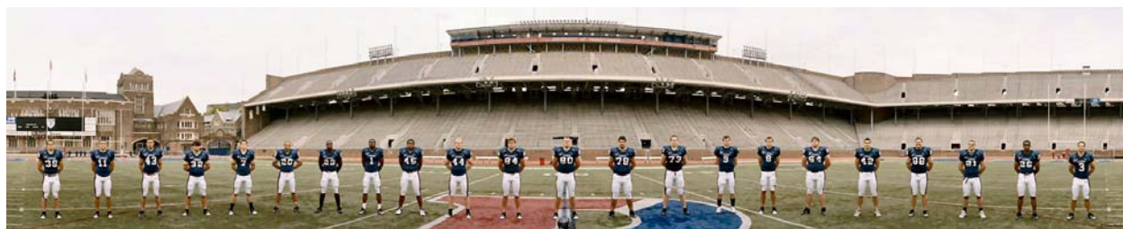
University of Pennsylvania 2008 Seniors