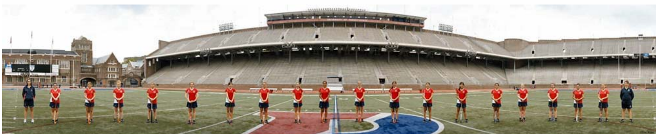
University of Pennsylvania Field Hockey 2008