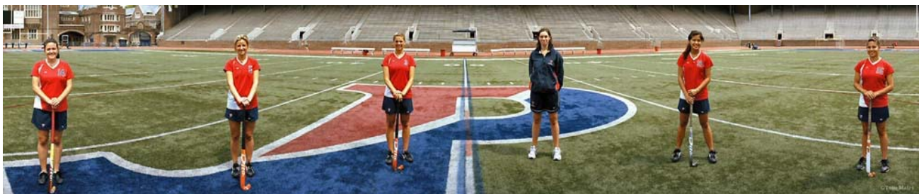
University of Pennsylvania Field Hockey Seniors 2008