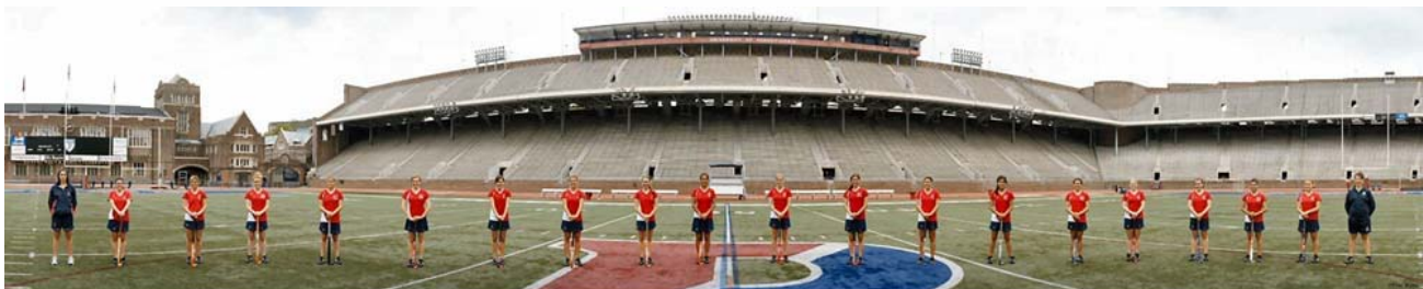
University of Pennsylvania Field Hockey 2008