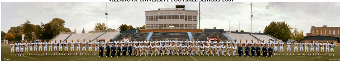
VILLANOVA UNIVERSITY FOOTBALL TEAM 2007