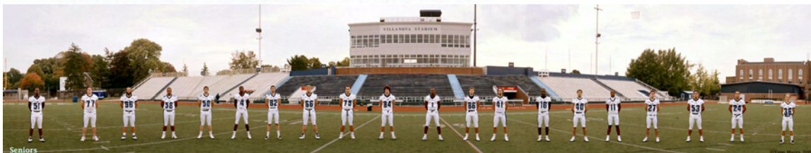
VILLANOVA UNIVERSITY FOOTBALL SENIORS 2007