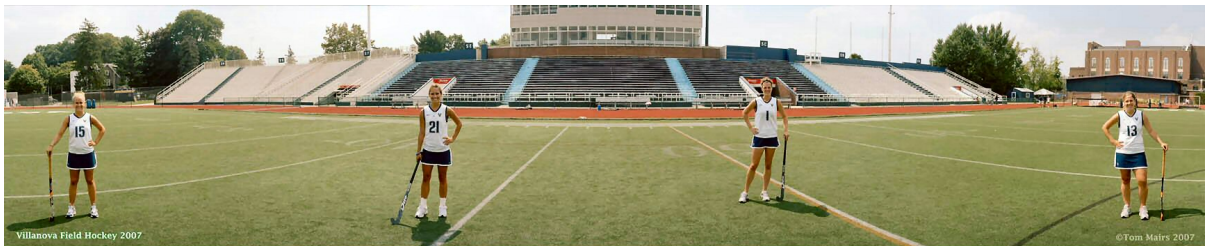
VILLANOVA FIELD HOCKEY SENIORS

$349.00 FRAMED AS ABOVE TITLE PLATE & VILLANOVA SEAL Plate can be personalized with Name Position Year Number