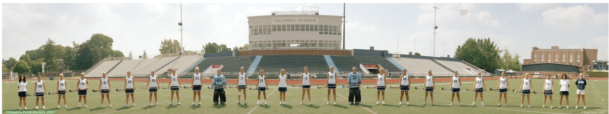
VILLANOVA FIELD HOCKEY TEAM 2007