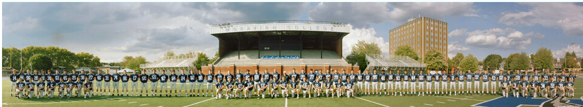
2007 MORAVIAN COLLEGE TEAM