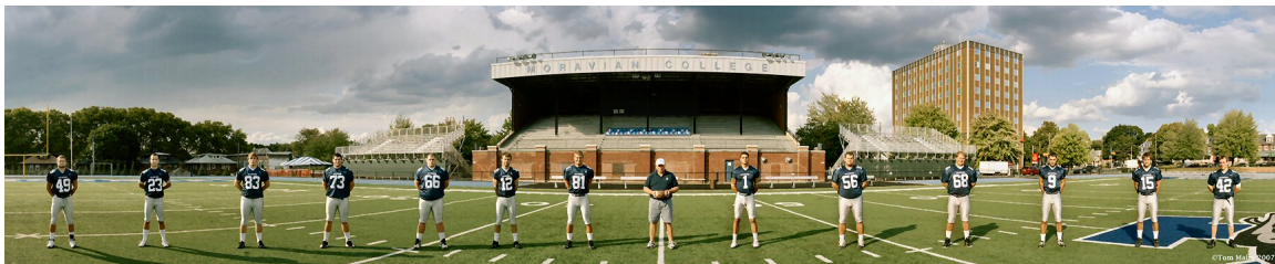
2007 MORAVIAN COLLEGE SENIORS